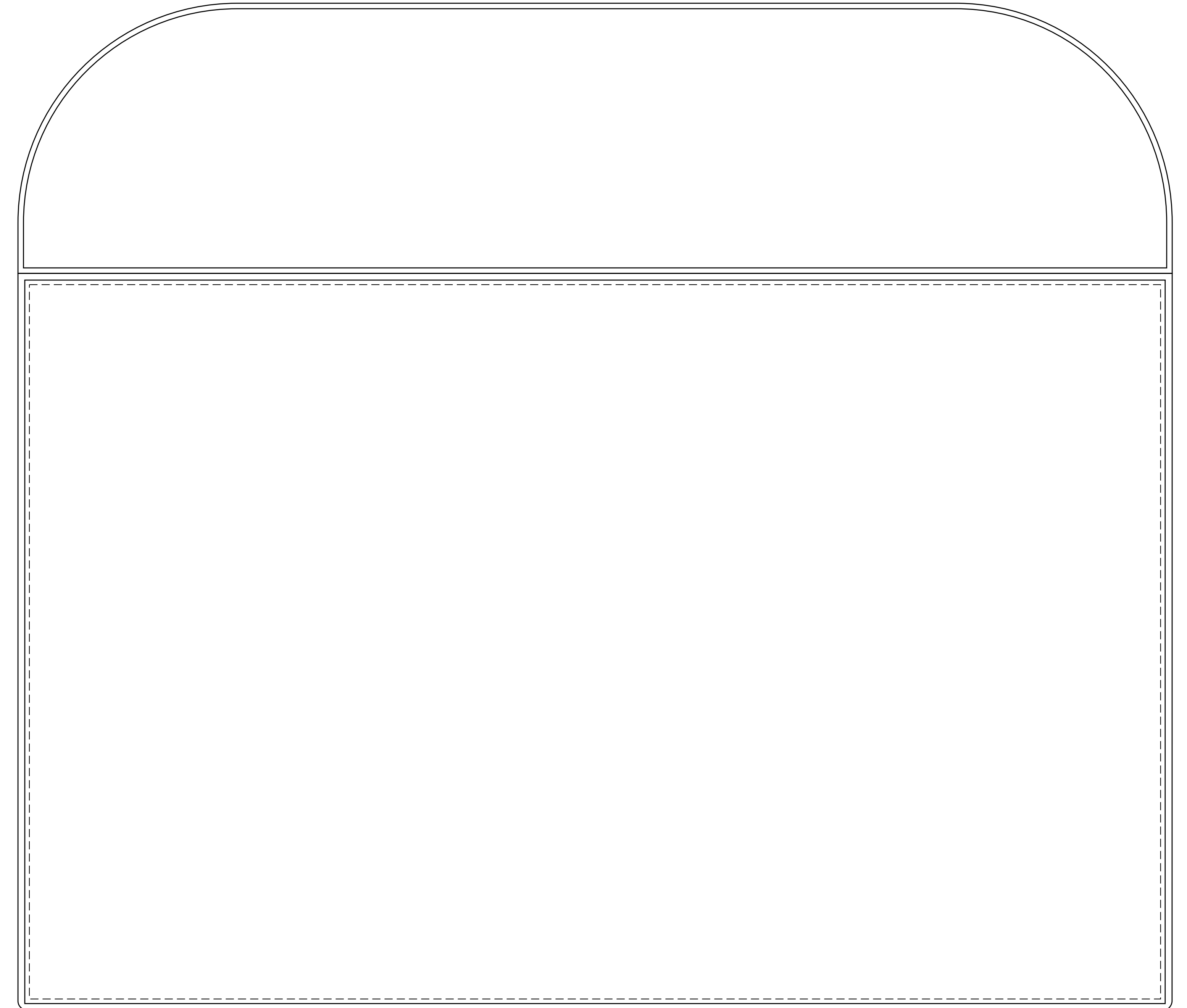
ITEM 6062 BACK VIEW